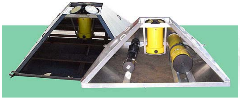
Sea Floor Trawl resistant platforms Pictured with Sontek® Argonaut™ series, battery and weight attachment.