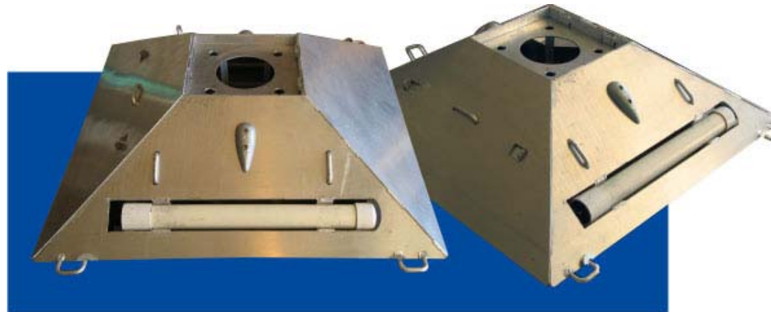
Sea Floor Trawl resistant platform for Sontek® Argonaut XR™ With integrated pvc weight container attachment.